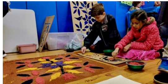
Students participating in a Family Heritage Night activity.