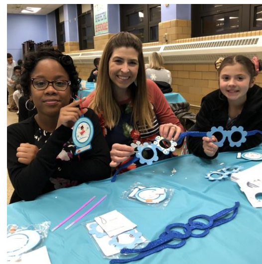
Craft making during the Snowball Social