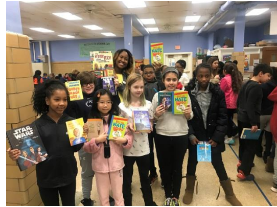
Students showing the books they received during RIF

For more information on how you can help contact aroniminkhomeandschool@gmail.com . You can also check out the Aronimink Home and School Association Facebook page.